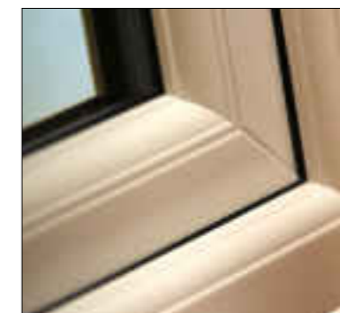
Ovolo finish on Total 70 S products Tilt & Turn Concealed gearing - all suites Hi-security multi-point locking - all suites