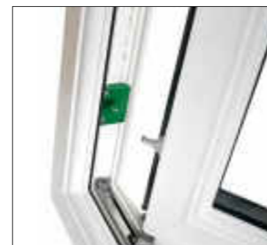
Fire escape friction stay to all side hung sashes Hinge Guards fitted to Rustique Welded co-extruded gasket - no more shrinkage