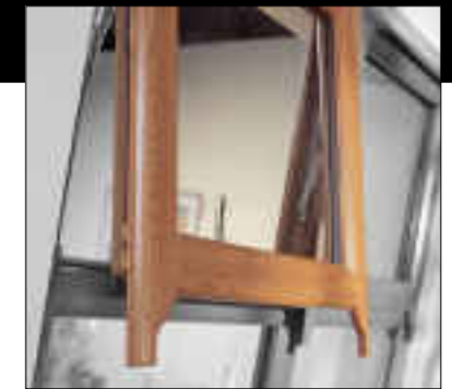
Run through sash horns on Rehau Total 70