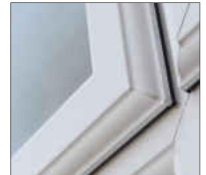
Ovolo finish to Logik 70 S products Feature grooving to all products