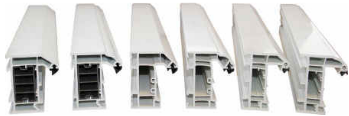
Eurocell Eurologik 70 chamfered Eurocell Eurologik 70 sculptured WHS Halo Rustique sculptured WHS Halo System 10 chamfered Rehau Total 70 chamfered Rehau Total 70 sculptured