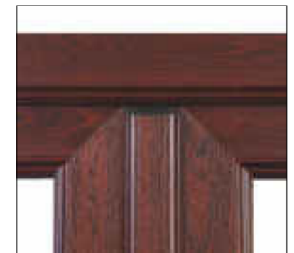
French Window Mullion to System 10 and Rustique