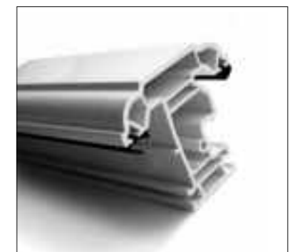
Unique Ovolo finish to all Rustique products