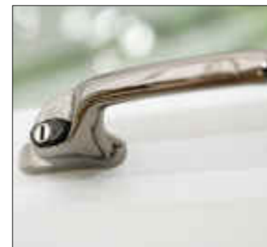
High security, Auto Lock suited handles Range of colours