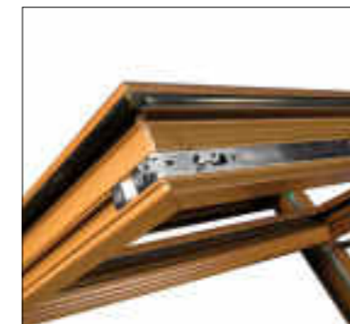
BS 7950 - Multi Point Shootbolt Tri-Clad finish (high performance tri-valent coating system)